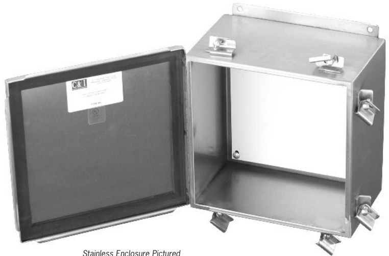
Stainless Enclosure Pictured

Construction: C & I Enclosures Type 4 Painted J.I.C. Continuous Hinge Boxes are fabricated in accordance with U.L. specifications from code gauge material. An oil resistant gasket is attached to the cover to prevent moisture or dust from entering the box. The boxes are provided with a continuous hinge and external screw clamps on three sides. All seams are continuously welded and ground smooth. External mounting feet are provided along with studs for mounting optional panels.